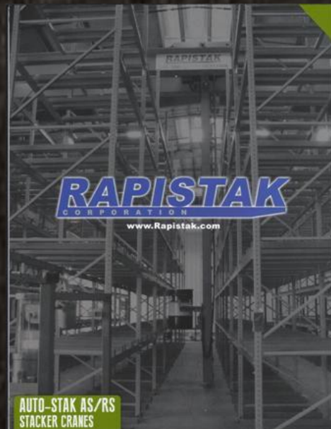
AUTO-STAK AS/RS STACKER CRANES