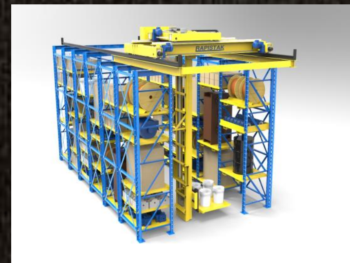
SINGLE AISLE SYSTEM