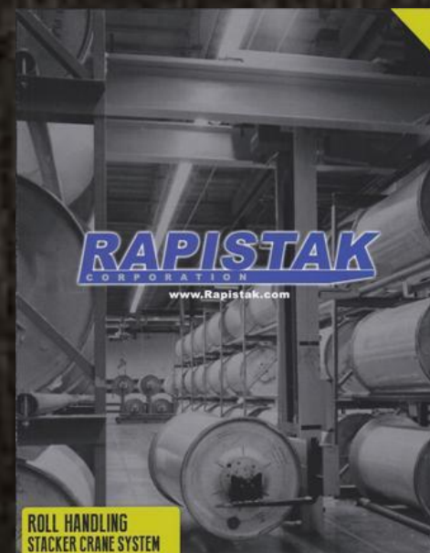
ROLL HANDLING STACKER CRANE SYSTEM