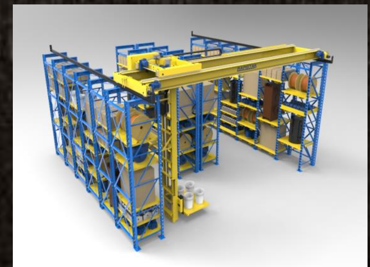
DOUBLE AISLE SYSTEM

Rack heights from 8 ft. to 25 ft. (2.44M to 7.62M)