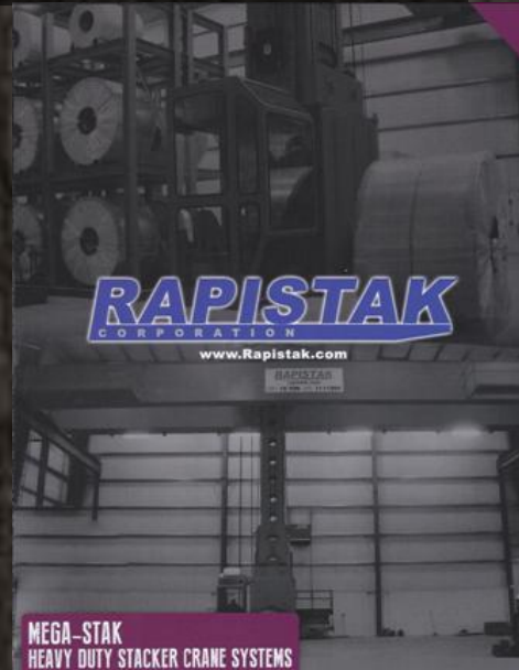
MEGA-STAK HEAVY DUTY STACKER CRANE SYSTEMS