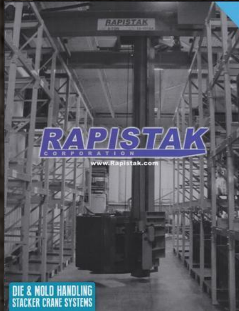
DIE & MOLD HANDLING STACKER CRANE SYSTEMS