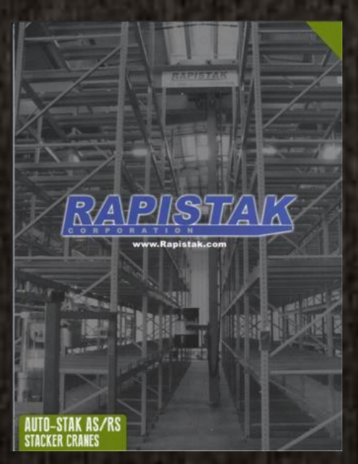
Automated Management Systems