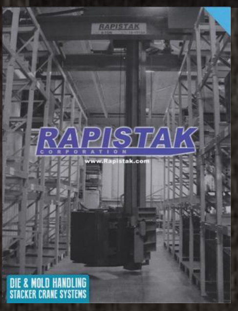
Die/Mold Management Systems