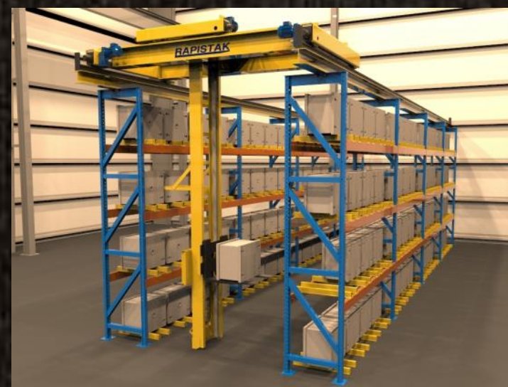
SINGLE AISLE SYSTEM