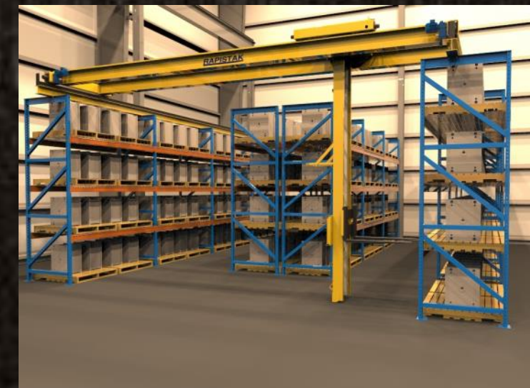
DOUBLE AISLE SYSTEM

Rack heights from 8 ft. to 25 ft. (2.44M to 7.62M)