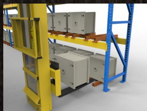
FORK BAR APPLICATION

Wire Mesh Decking is used when products are placed on pallets. Fork Bars raise the products to allow the stacker forks to lift the individual items.