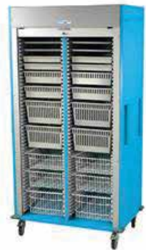
SPECIALTY STORAGE CABINETS