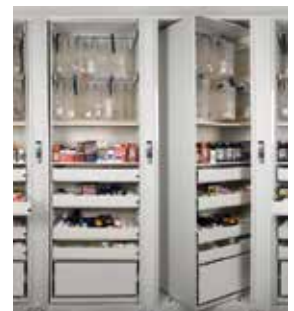
ROTARY STORAGE CABINETS