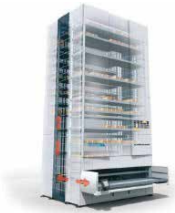
AUTOMATED VERTICAL CAROUSELS

space and people. We specialize in helping manage costs with organizational solutions to improve the flow of materials, maximize the use of floor space, and enhance the productivity of personnel.