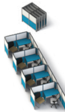
MOBILE FOLDING WORKSPACES