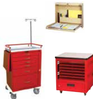
SECURITY CARTS AND WALLRIGHTS