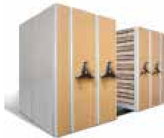
HIGH DENSITY MOVABLE SHELVING